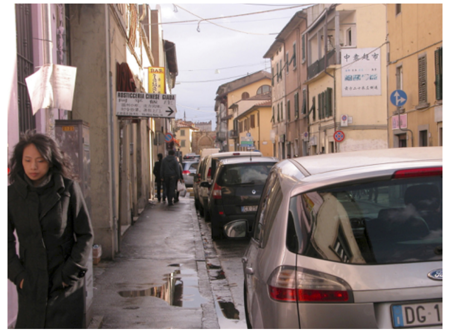
Figure 3. Chinese retail activities in Prato