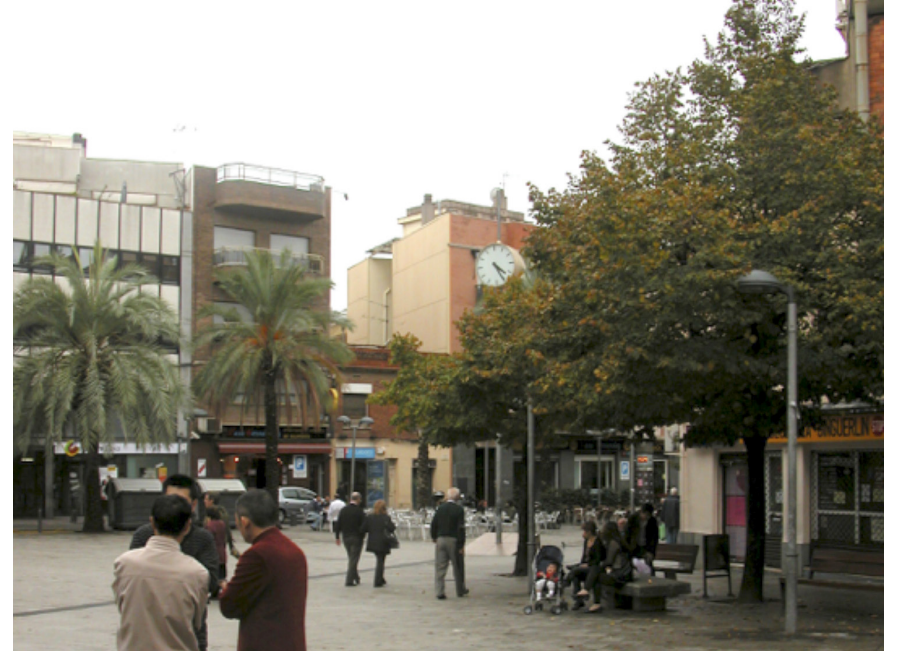
Figure 4. Plaza del Reloj in Santa Coloma de Gramenet